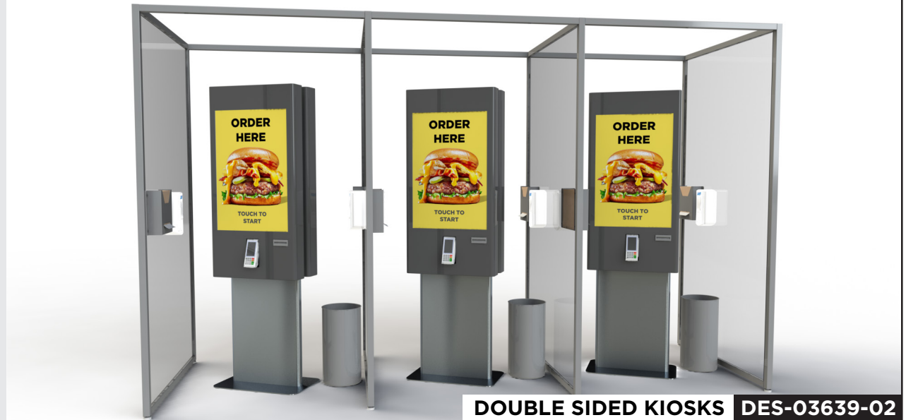
DOUBLE SIDED KIOSKS DES-03639-02

Sterilcoat: Germicidal Powder Coating available by request. Additional costs may apply.