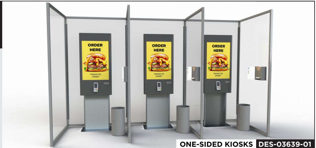
ONE-SIDED KIOSKS DES-03639-01

Email for pricing and lead times: sales@artitalia.com