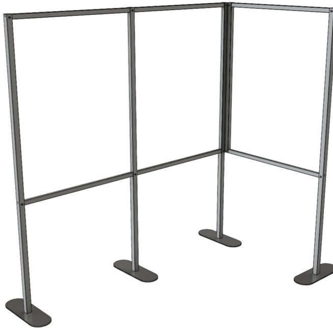
INLINE CONFIGURATION DES-03645-02