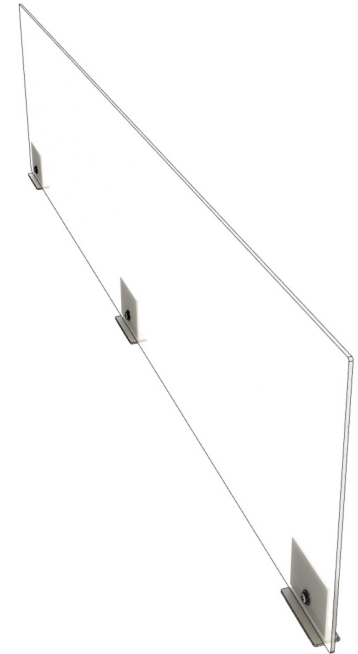
TOP DIVIDERS DES-03645-03