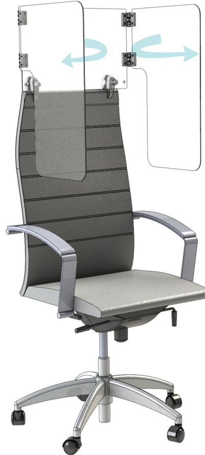
FOLDABLE U-SHAPE DES-03669-01