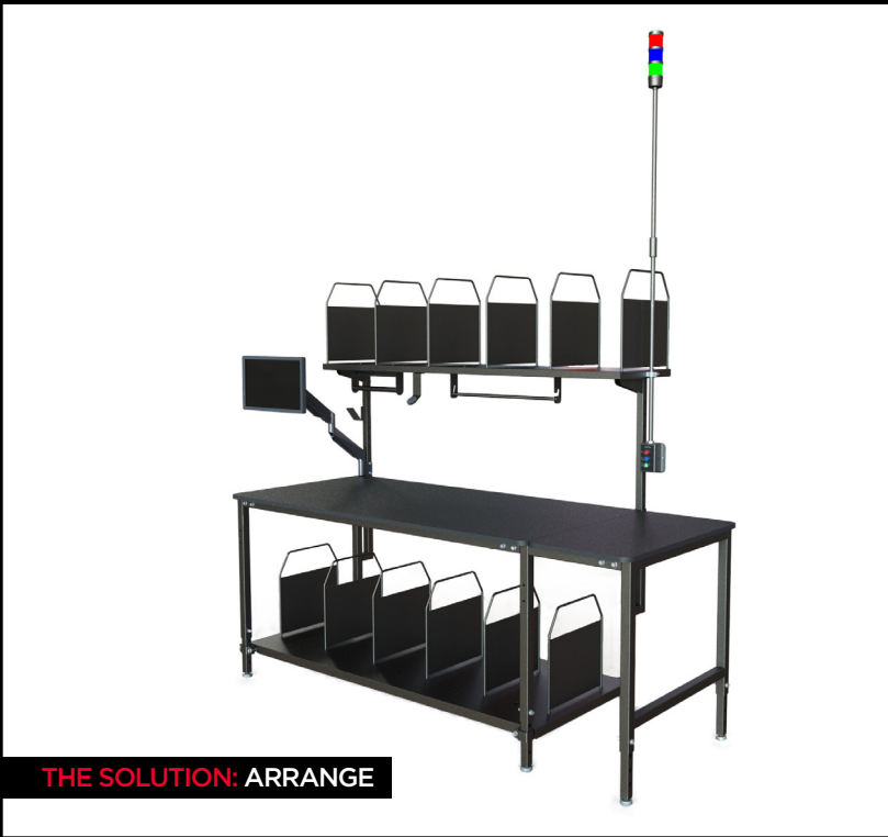
THE SOLUTION: ARRANGE

THE PROBLEM: The lack of a proper pick and pack workstation in your distribution center can be detrimental to your fulfillment operations creating bottlenecks and damaging to your company's reputation.