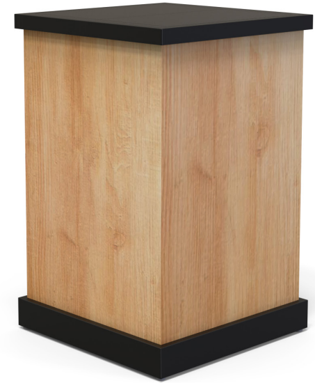
3.CLOSED & SECURE