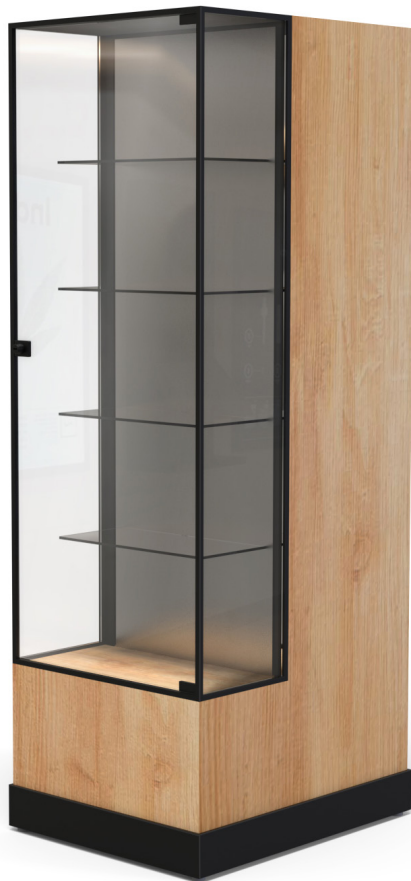
1.OPEN TO DISPLAY