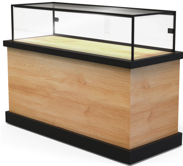
1.OPEN TO DISPLAY