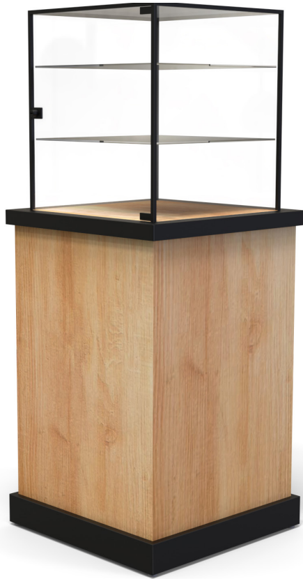
1.OPEN TO DISPLAY