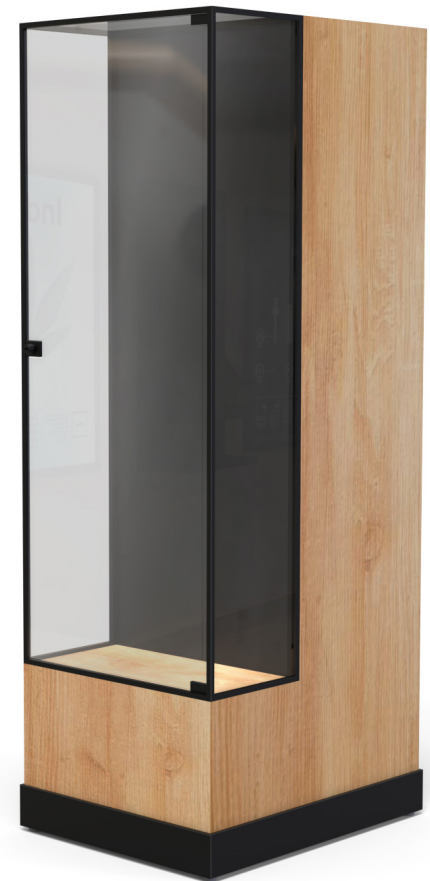
3.CLOSED & SECURE