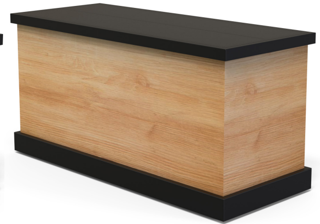
3.CLOSED & SECURE