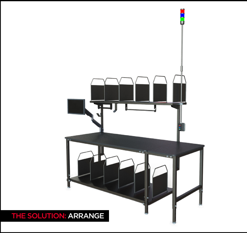
THE SOLUTION: ARRANGE

THE PROBLEM: The lack of a proper pick and pack workstation in your distribution center can be detrimental to your fulfillment operations creating bottlenecks and damaging to your company's reputation.